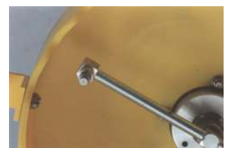
Rotating high pressure nozzle system