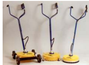
Roof and surface cleaning

cover. The units are capable of pressures up to 300bar, which means they can be attached to most high pressure cleaners.