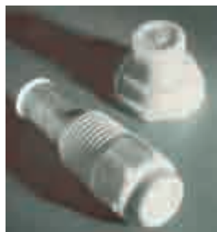
SF &amp; SM Nozzles

The SF and SM plastic spray nozzles from Spraying Systems are designed for use in fog cooling systems, which makes them ideal for the pig and poultry industry. The nozzles are available in five different capacities, and are able to operate up to a maximum pressure of 14 bar. The tips are manufactured from Acetal to minimize mineral build-up in the flow passage. Monitor is able to design complete systems including all pumping and piping requirements.