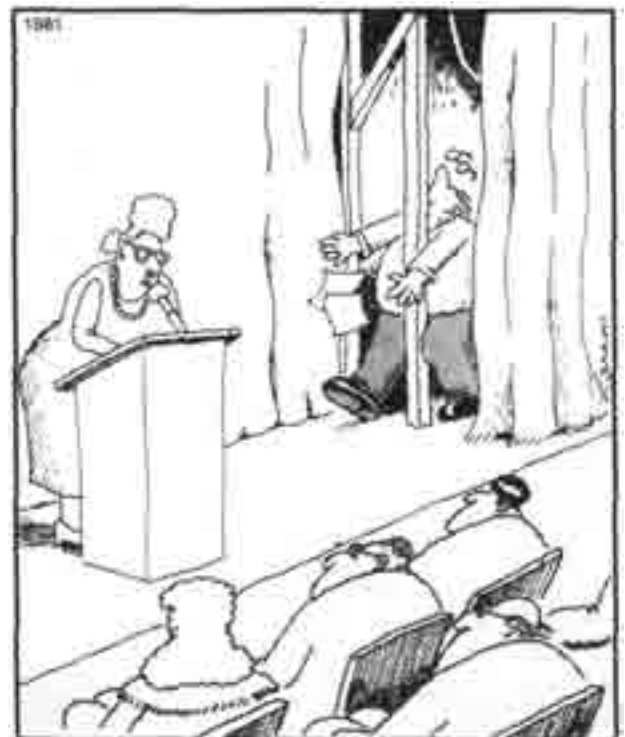
"And so, without further ado, here's the author of Mind Over Matter... "

"When faced with a problem - adopt the attitude that you can, and will, succeed in solving it."