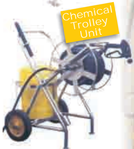
Chemical Trolley Unit