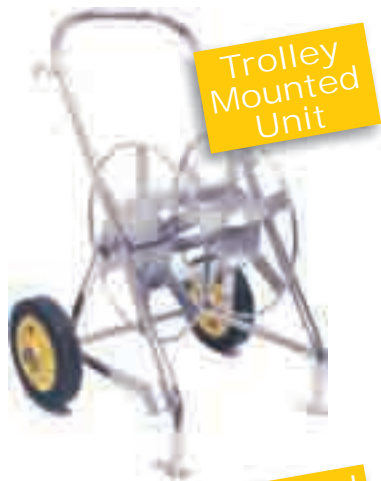
Trolley Mounted Unit