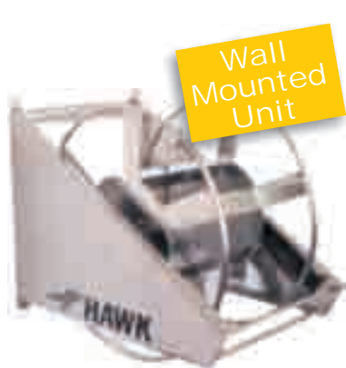
Wall Mounted Unit