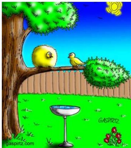
Someone poured fabric softener in the bird bath!

"It is better to keep your mouth closed and let people think you are a fool than to open it and remove all doubt." Mark Twain